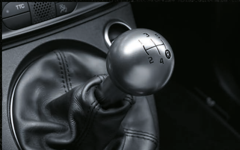
595 Competizione – Aluminium gear knob.