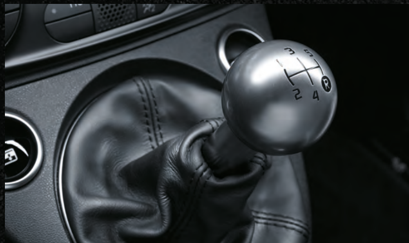
595 Competizione – Aluminium gear knob.