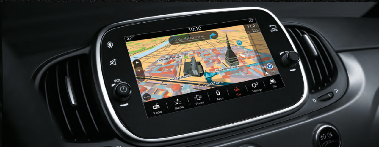
595 – Optional Uconnect™ 7" HD Touchscreen NAV DAB radio, Live services, Bluetooth® with 6 speakers, audio streaming, USB and AUX.

Due to the complexity of the Abarth Range, some options may be linked to or be incompatible with other options. In view of constant product development, some options may also be linked to options made available after the publication of this pricelist. Please refer to your local Abarth dealer for detailed information about the incompatibilities and links between options.