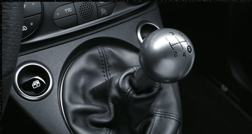
595 & 695 – Aluminium gear knob.