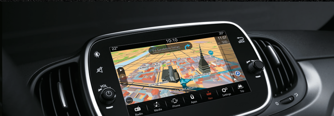
595 – Optional Uconnect™ 7" HD Touchscreen NAV DAB radio, Live services, Bluetooth® with 6 speakers, audio steaming, USB and AUX.

Due to the complexity of the Abarth Range, some options may be linked to or be incompatible with other options. In view of constant product development, some options may also be linked to options made available after the publication of this pricelist. Please refer to your local Abarth dealer for detailed information about the incompatibilities and links between options.