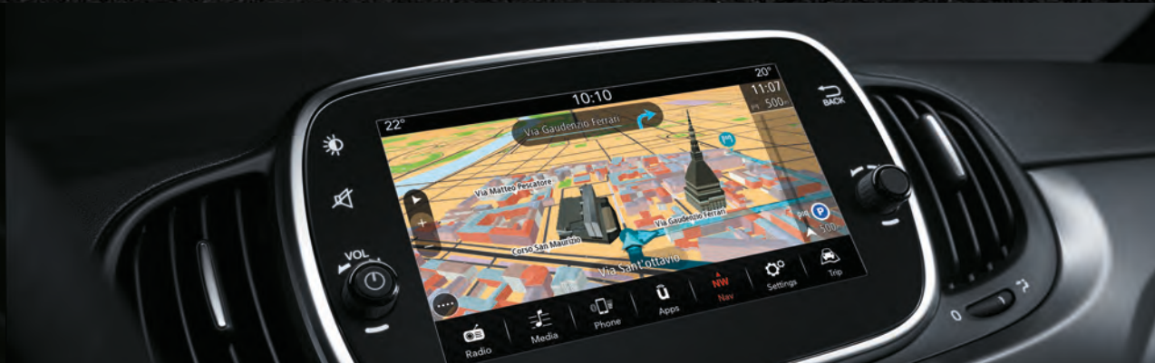
595 – Optional Uconnect™ 7" HD Touchscreen NAV DAB radio, Live services, Bluetooth® with 6 speakers, audio streaming, USB and AUX.

Due to the complexity of the Abarth Range, some options may be linked to or be incompatible with other options. In view of constant product development, some options may also be linked to options made available after the publication of this pricelist. Please refer to your local Abarth dealer for detailed information about the incompatibilities and links between options.