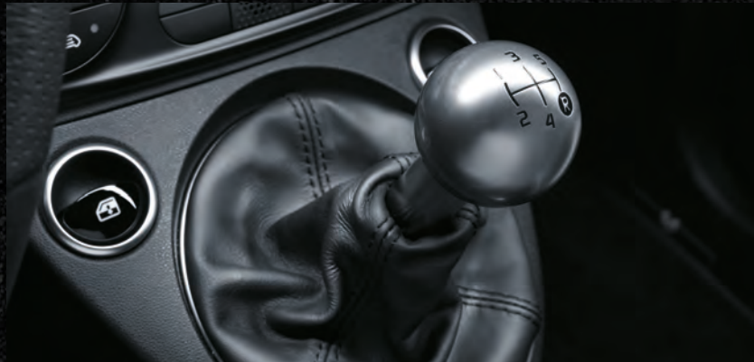
595 Competizione – Aluminium gear knob.