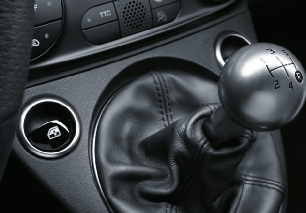
595 & 695 – Aluminium gear knob.