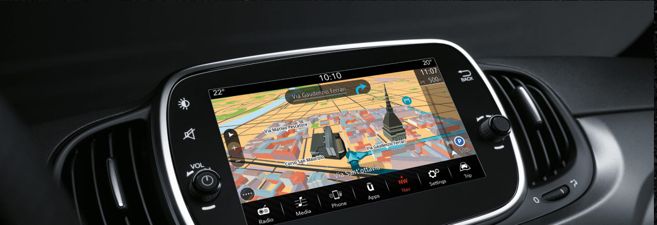
595 – Optional Uconnect™ 7" HD Touchscreen NAV DAB radio, Live services, Bluetooth® with 6 speakers, audio steaming, USB and AUX.

Due to the complexity of the Abarth Range, some options may be linked to or be incompatible with other options. In view of constant product development, some options may also be linked to options made available after the publication of this pricelist. Please refer to your local Abarth dealer for detailed information about the incompatibilities and links between options.