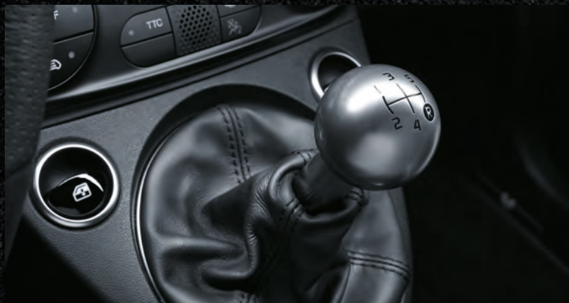
595 & 695 – Aluminium gear knob.