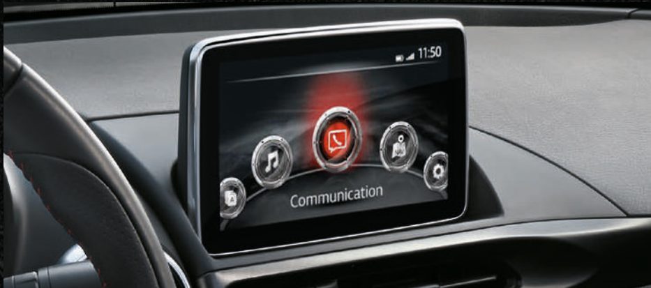
7" touchscreen with multimedia control.