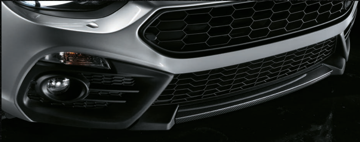
Carbon Fibre Front Dam (MOPAR Accessory)