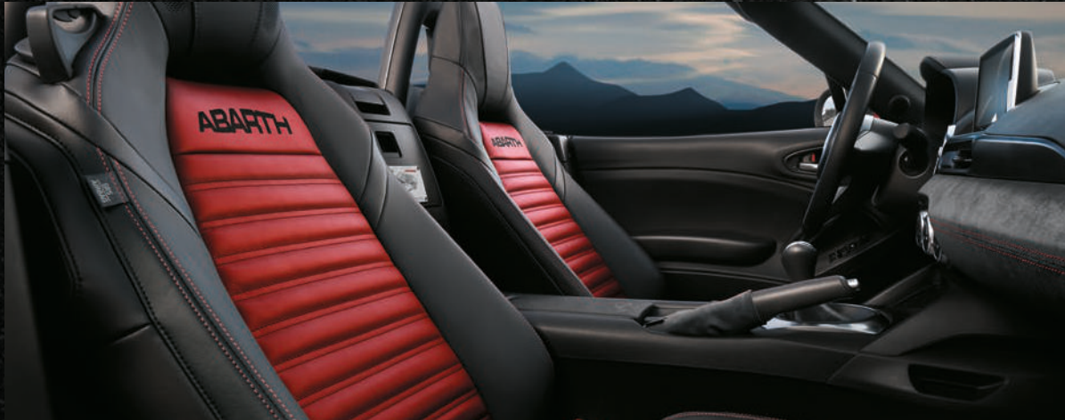
Racing Alcantara® kit. Technology that is 100% Made in Italy, increased grip, reduced weight, racing-inspired, craftsmanship of an Italian tourer.