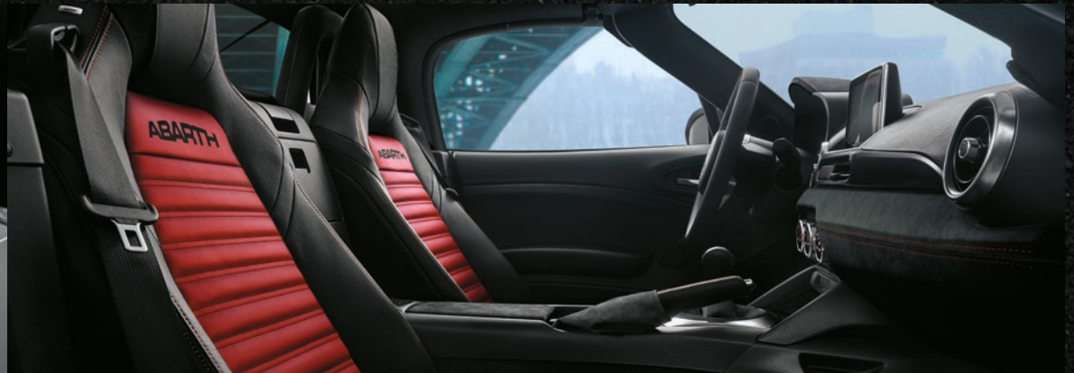
Leather Sports Seats