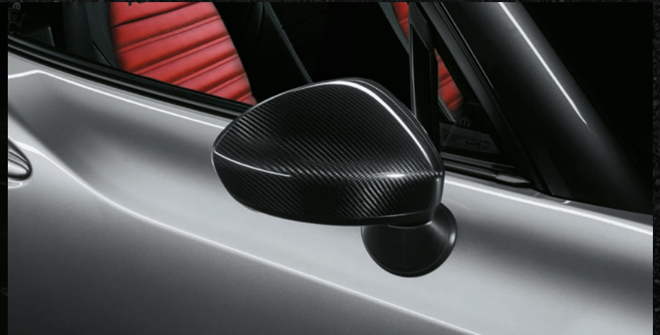
Carbon Fibre Mirror Covers (MOPAR Accessory)