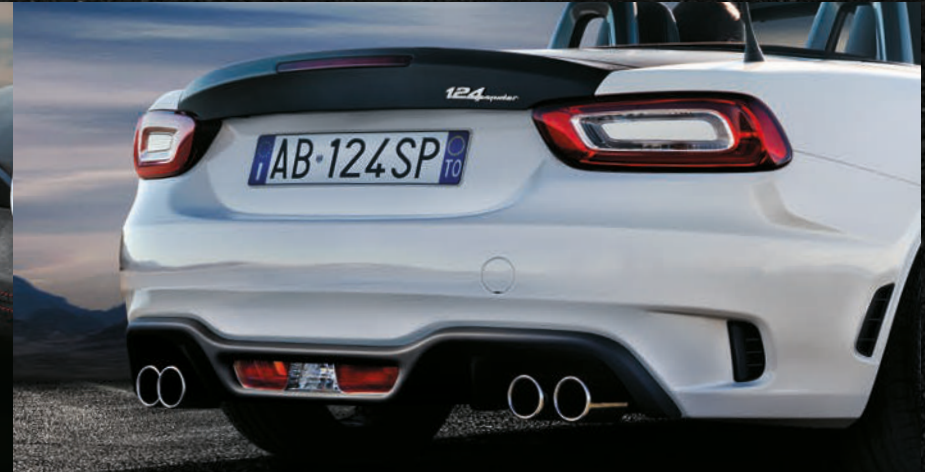
Aerodynamic Diffuser. To increase the road handling.