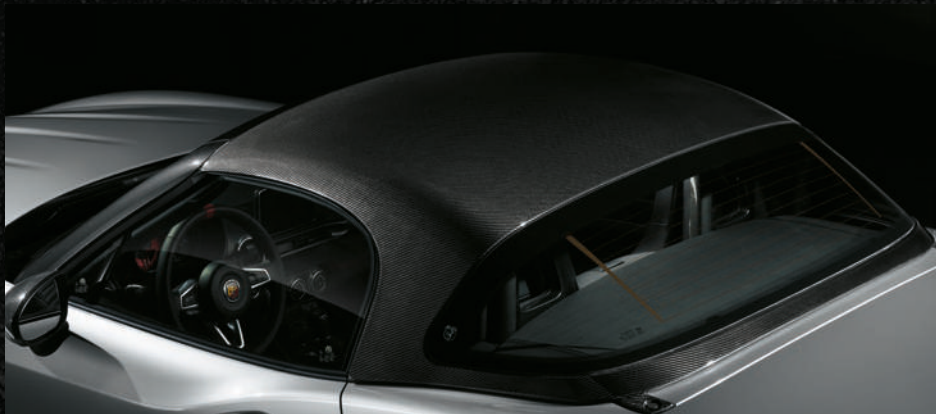
Carbon Fibre Hard Top