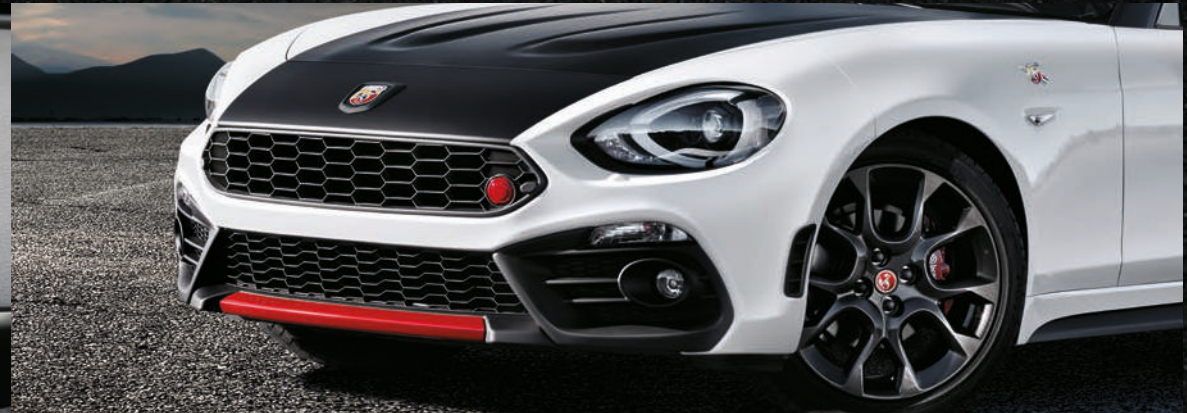
Racing anti-glare kit. Bonnet painted black for better visibility and an unmistakable design.