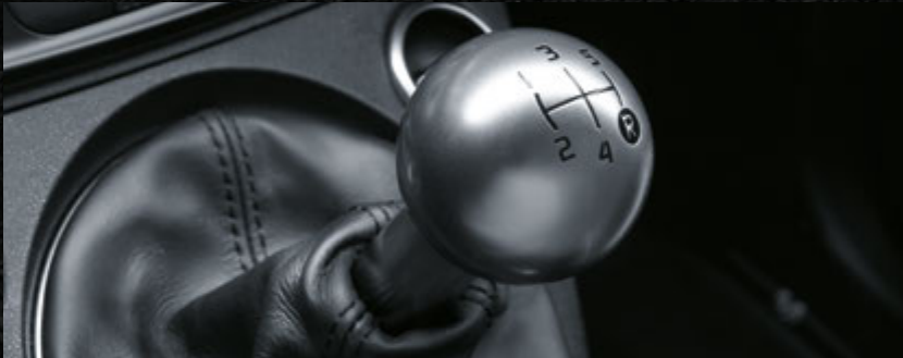
595 Competizione – Aluminium gear knob.