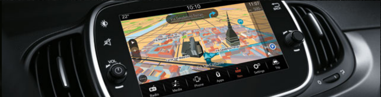
595 – Optional Uconnect™ 7" HD Touchscreen NAV DAB radio, Live services, Bluetooth® with 6 speakers, audio steaming, USB and AUX.